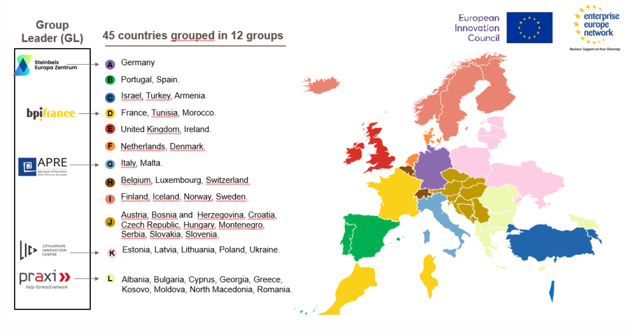
1 FIGURE - EEN2EIC - THE MAP OF THE GROUPS IN WP3