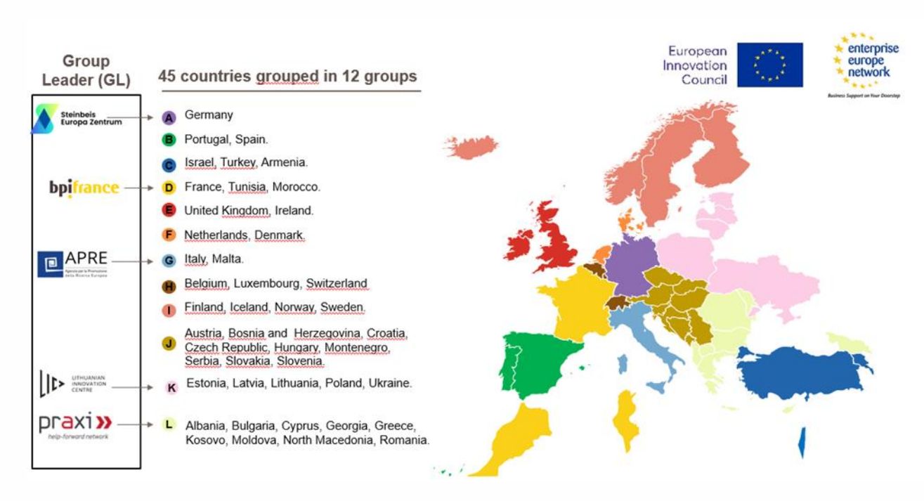
2 FIGURE - EEN2EIC - The map of the groups in WP3.

ENN2EIC Coordination will work with local EEN members as the Local Nodes (LN). One EEN member supporting SoE holders in their region / EEN consortium will be selected as a Local Node for the WP3 – Support of Seal of Excellence holders. Local EEN members will be selected during the first phase of the project and will be completing the role of Local Node during the entire duration of the project. LN will closely cooperate with selected GLs in their groups (subject of this call point 2 Group Leader) and LN will be in charge of the direct communication and provide direct support of SoE companies in the regions defined as their scope of action (See map below):